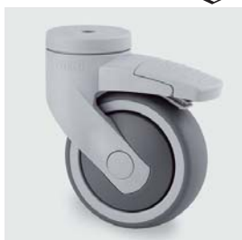
5377 with grey pedal – optional (RAL7001)