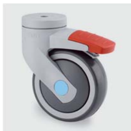
5387 Swivel castor with total lock