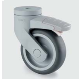
5325 PJO 075 with grey pedal – optional (RAL7001)