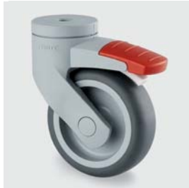
5325 PJO 075