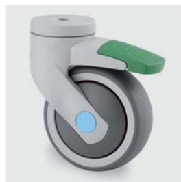
5381 Swivel castor with directional lock