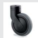
RAL 9011 graphite black