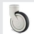
RAL 9002 grey white