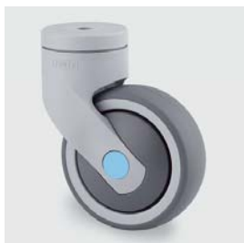
5380 Swivel castor