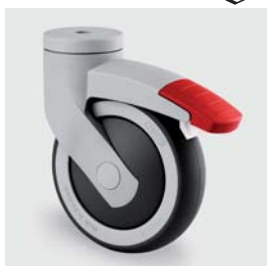
5387 Swivel castor with extended fork and brake pedal, with total lock