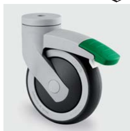
5381 Swivel castor with extended fork and brake pedal, with directional lock

Please ask for our catalogue and visit us online: www.tente.com