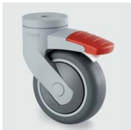
5325 PJP 075