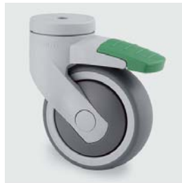
5371 Swivel castor with directional lock