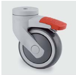
5377 Swivel castor with total lock