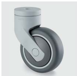
5320 PJP 075