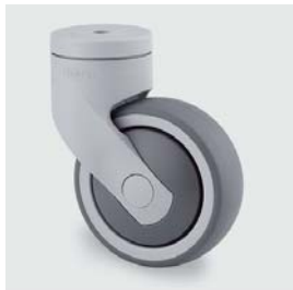
5370 Swivel castor