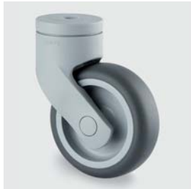
5320 PJO 075