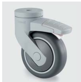
5325 PJP 075 with grey pedal – optional (RAL7001)