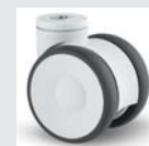
RAL 9002 grey white