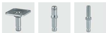
Plate Stem with circlip Threaded Stem

Made of high grade synthetic materials, with blind hole L51, all fittings are blue passivated