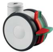
1 - free - Swivel castor