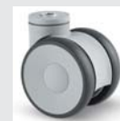
RAL 7001 silver grey