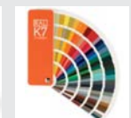
Various colours are (quantity depending) available.