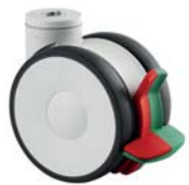
3 - directional lock and wheel lock = total lock