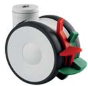
2 - directional lock